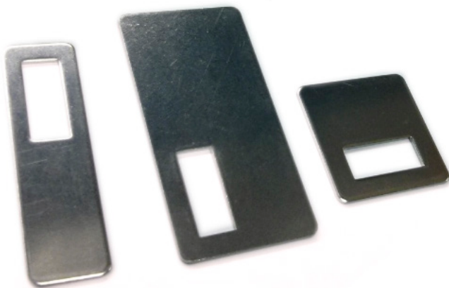
eLock Metal Plate Extension