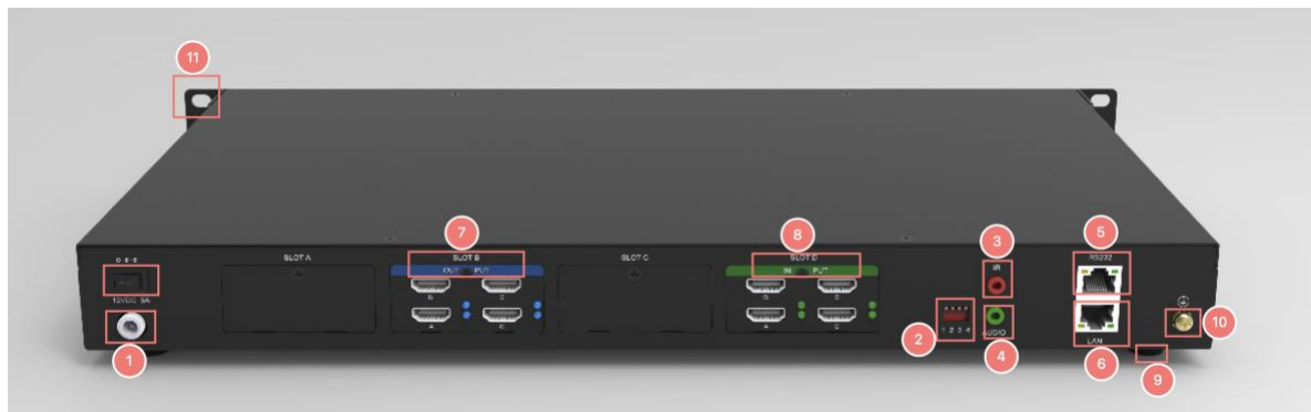
Model: iWall X404