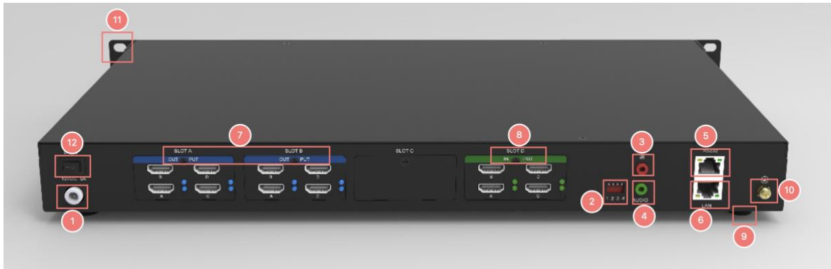
Model: iWall X408