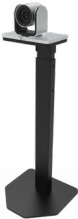
CAMERA-STAND-PTZ front view with Poly Eagle Eye IV camera, not extended