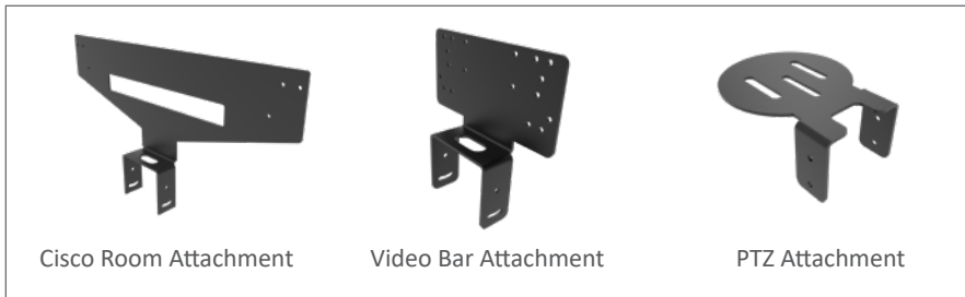
Cisco Room Attachment