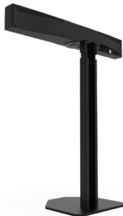
CAMERA-STAND-PTZ back view with Yealink A30 MeetingBar camera, not extended