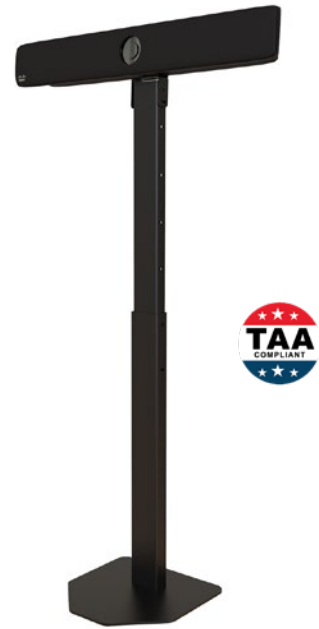
CAMERA-STAND-CRK extended with Cisco Room Bar camera